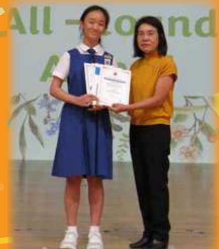
Our All-Round Awardee, our pride