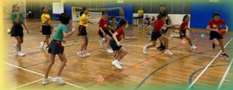
Rugby is a fast and fun sport