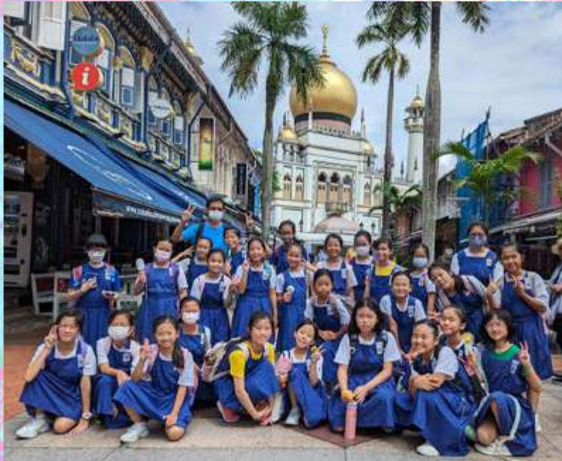
Learning about the historical significance of Kampung Glam