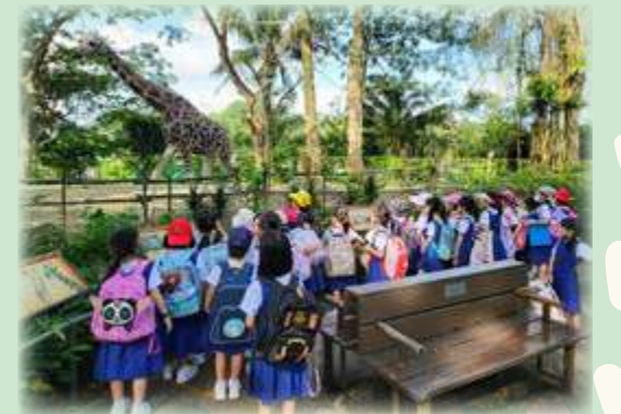
Giraffe! Giraffe! You're so tall!