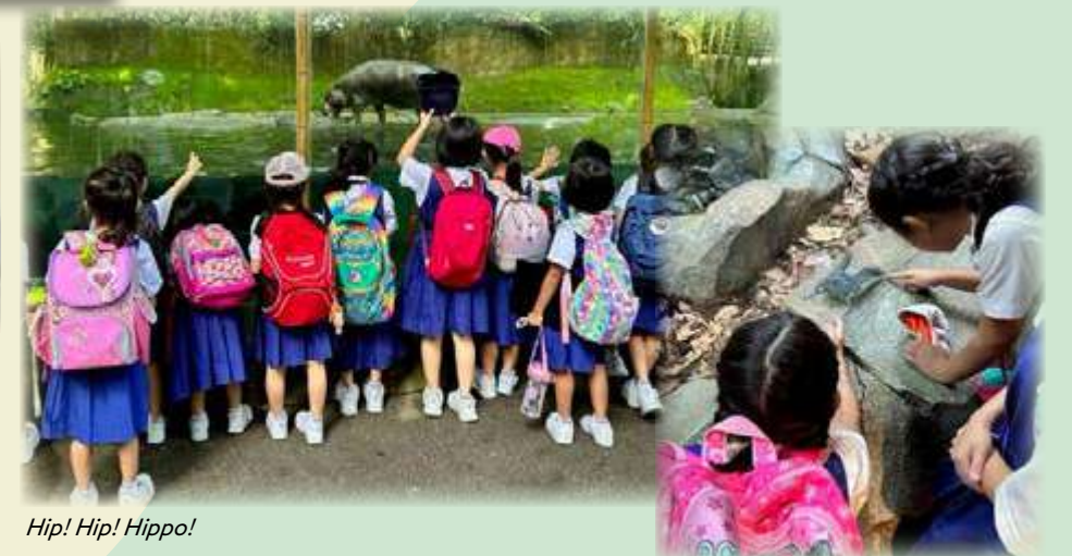
Hip! Hip! Hippo!