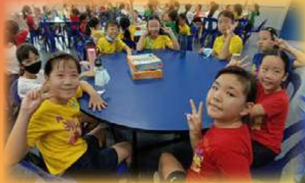
All smiles, cheery and ready to play