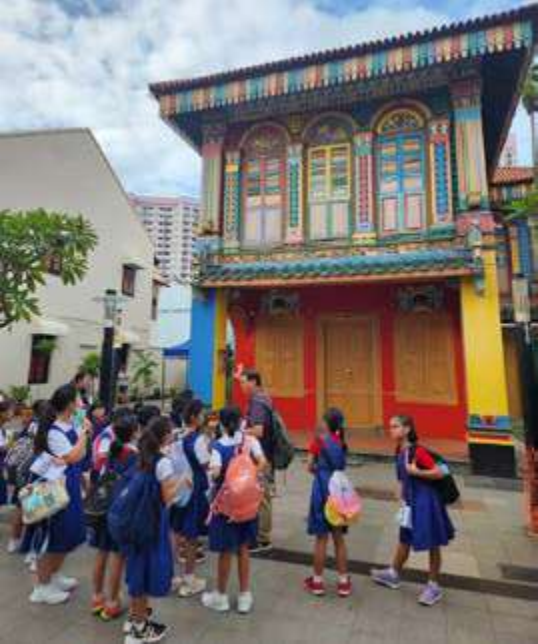
Be amazed by the beautiful colours and architecture