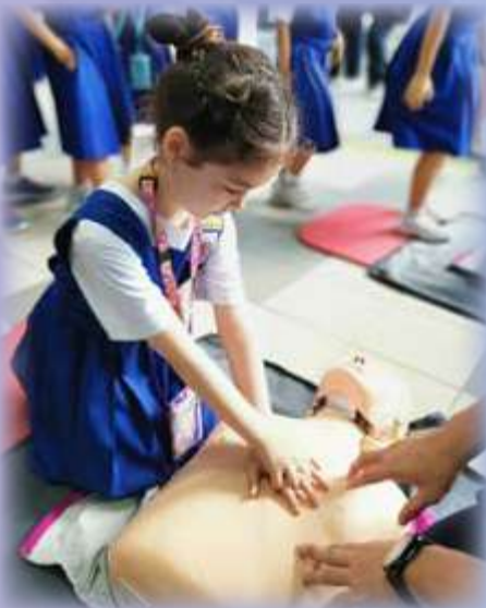
An attempt at performing cardiopulmonary resuscitation (CPR)