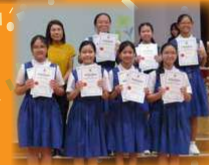
We finally made it!