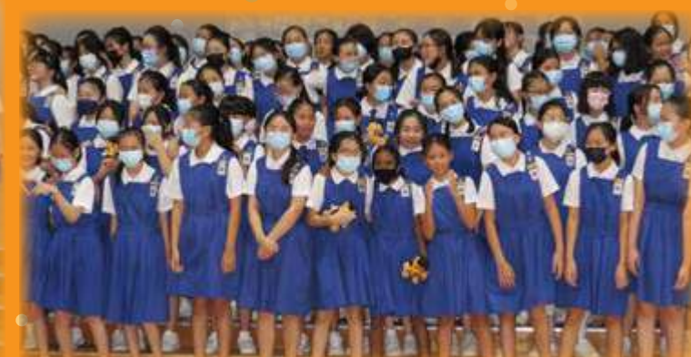
Carrying on our tradition of singing 'Hold on to our Dreams'