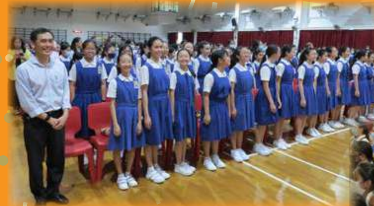
Bright lovely smiles