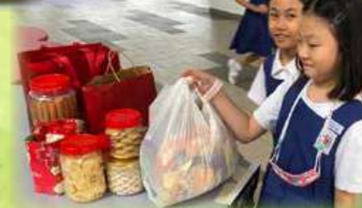
Pupils donating CNY goodies to Food Bank