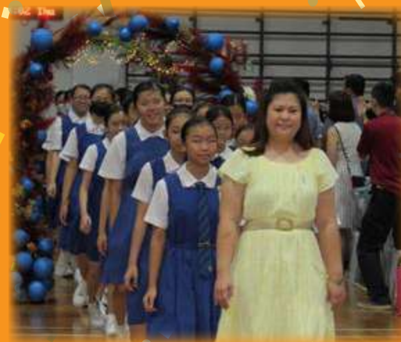
Grand march in