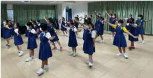
Dancing together is fun!