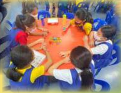
Having a great game of Tic-Tac-Toe