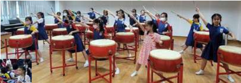
Let's play drums in style!