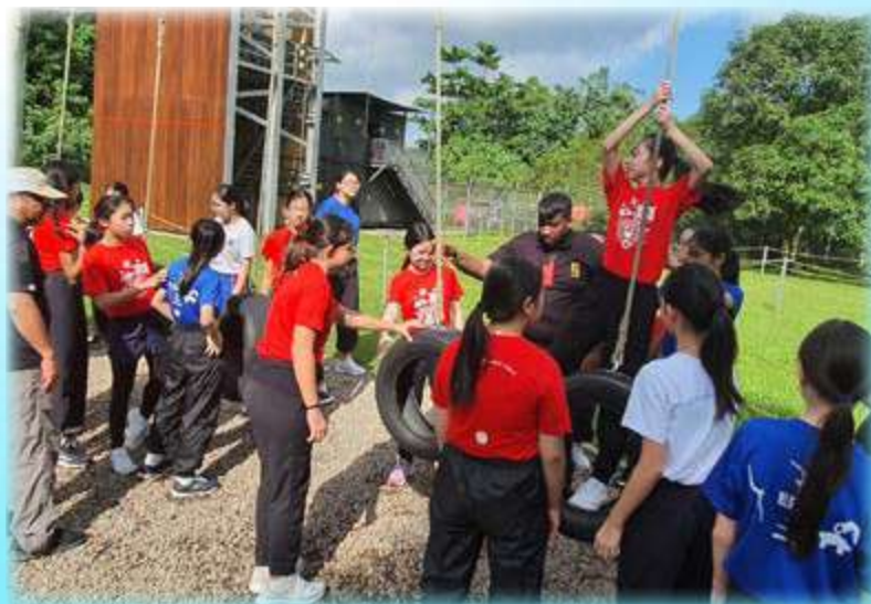
这个挑战难不倒我