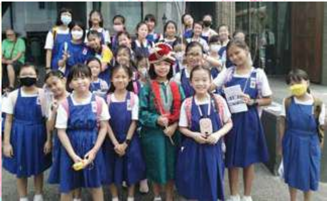
Posing with our 'Little Indian Prince' at Little India