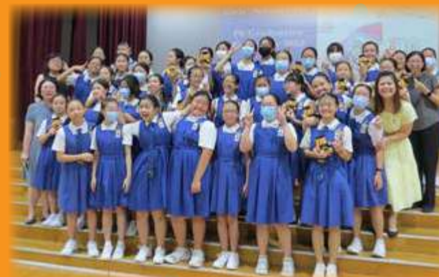
Making memories together