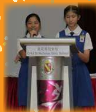
Our student emcees, calm and composed