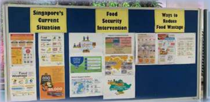
Learning more about saving food