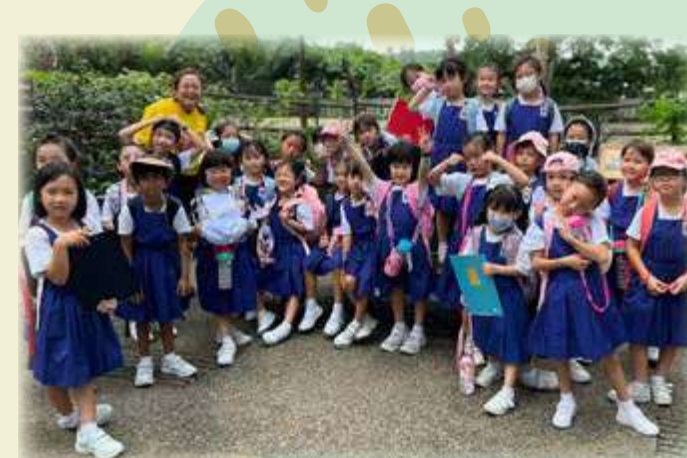
It's group photo time!