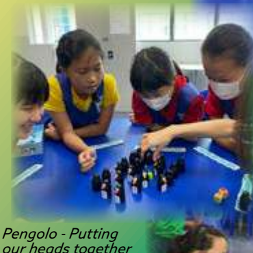
Pengolo - Putting our heads together to remember the coloured eggs