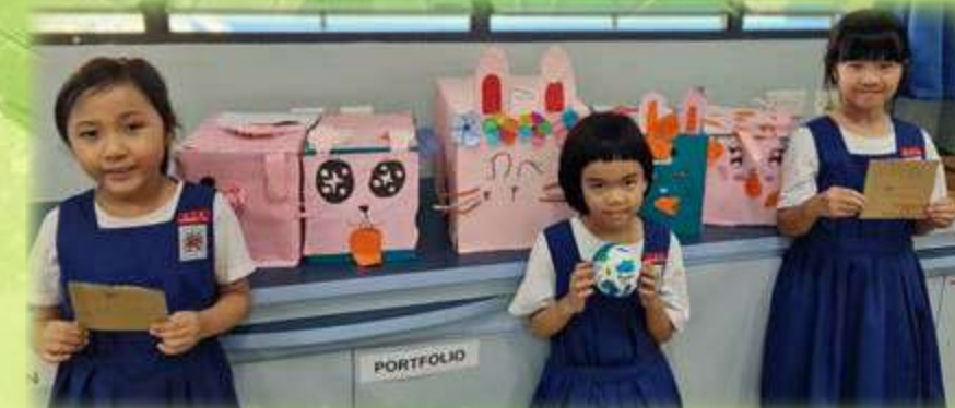
We love making rabbit recycling boxes!