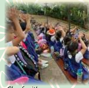
Clap for it!