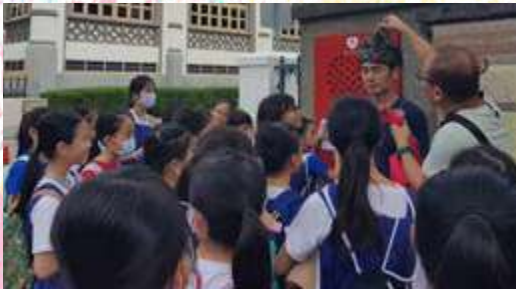
Let's dress up