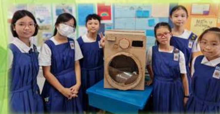
Look at our new invention - a washing machine that dispenses chocolate!