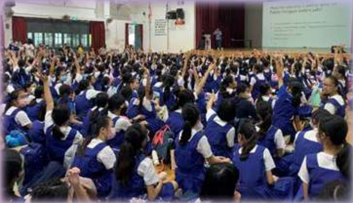
Enthusiastic response during the presentation by the Land Transport Authority