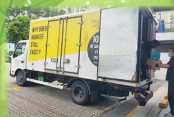
Helping to load up the CNY goodies