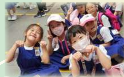
Waiting to enter!