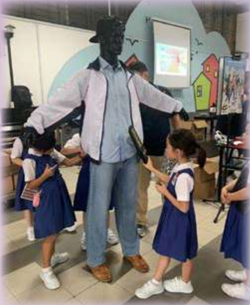
Freeze! Security check