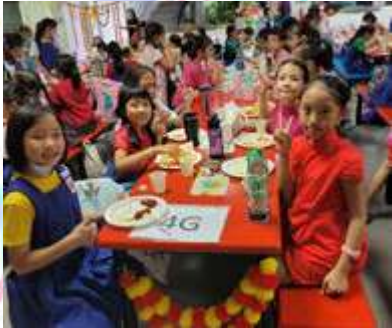
Enjoying cuisines from the different cultures