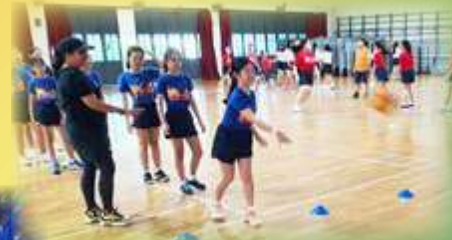
Getting our first taste of Tchoukball