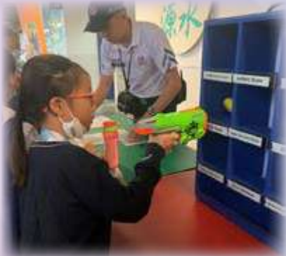
Ready, aim, fire!