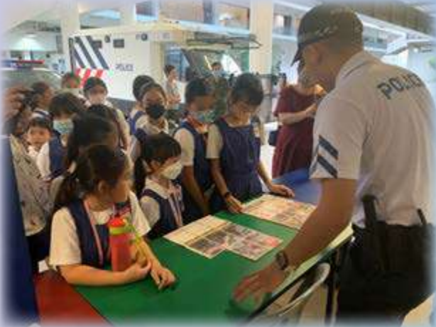
There are games and prizes to be won!