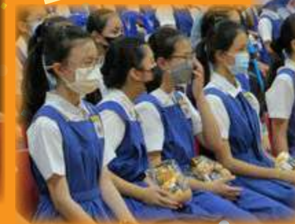
Listening attentively to advice and sharing