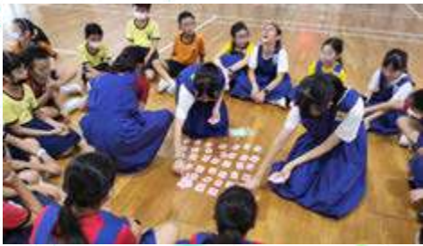
Fun and laughter playing games with Peiying Primary School pupils