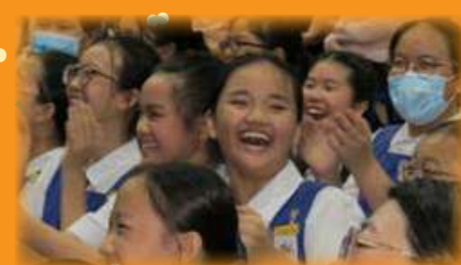
Fun, joy and laughter