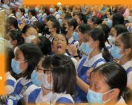
Caught in the act