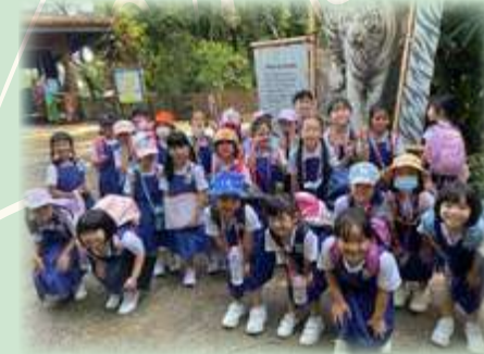
Let's meet the white tigers!