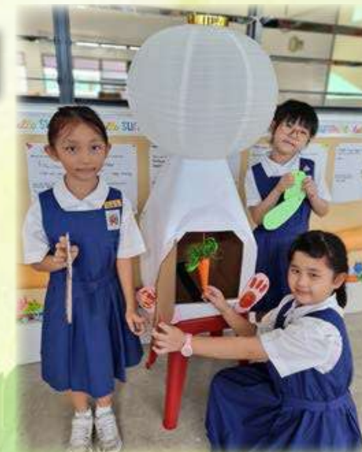
Let's reuse our CNY decorations to make our recycling box!