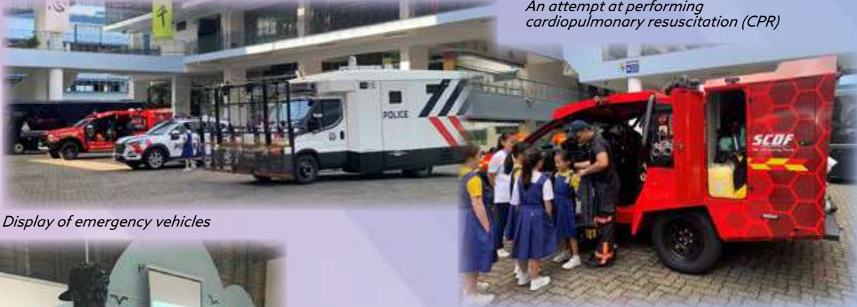
Display of emergency vehicles