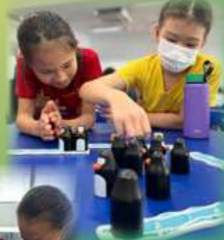
Experiencing the joy of playing together