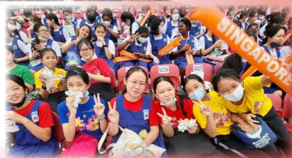
耐心等待表演开始