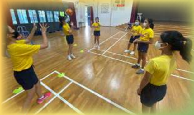
We rock in Tchoukball