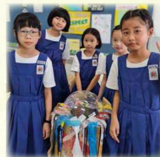
Hmm...my cat house broke. Let's make a jellyfish recycling box with it!