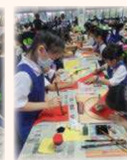
我们都聚精会神地写字。