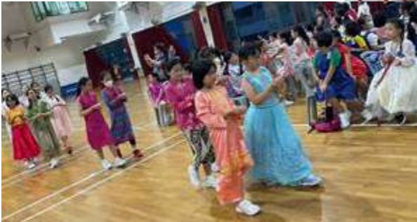
Dressed to the nines for the staged wedding