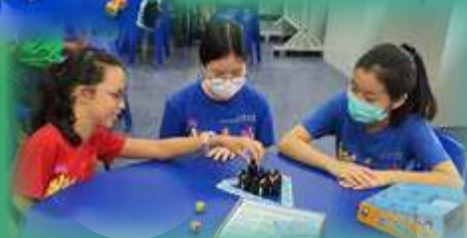
Pengolo - We have to find the hidden egg!