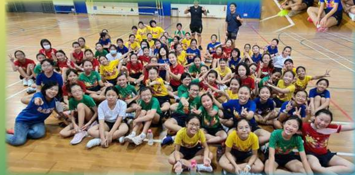
Displaying the house spirit during Games Day