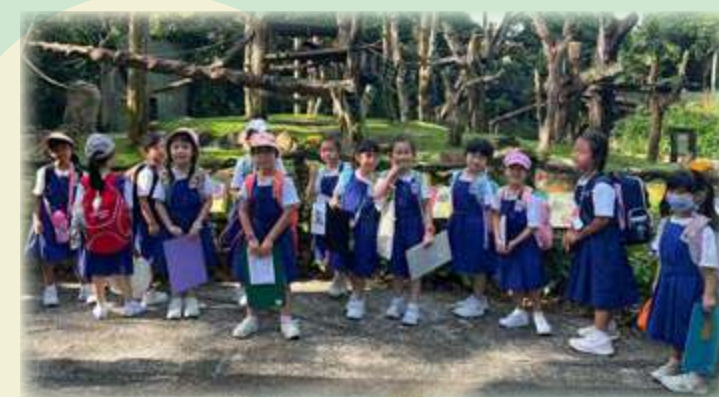
Orang utans gone missing!