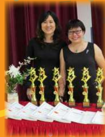
All ready for the ceremony